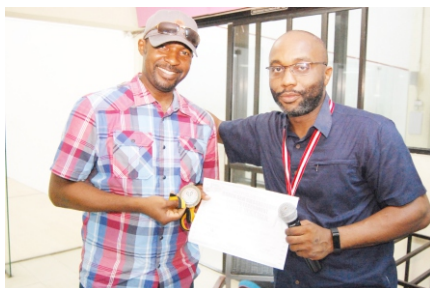
TABLE TENNIS SECTIONAL EVENT